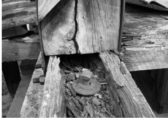
Fig. 6. Decayed beam supporting a timber column.