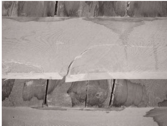
Fig. 3. Failure of a joist in a silver-mining mill.

Concerns about deterioration. Deterioration of wood can be the result of physical processes (weathering, failure due to overload, mechanical damage, or shrinkage) or biological processes (decay and insect attack). Structural timber will typically have checks on one or two faces, which are due to differential shrinkage of the timber and are part of the natural process as the wood dries (Fig. 2). A check is a separation of wood fibers in a piece of lumber, post, or timber, typically along the length of the piece, that results from the drying of the wood after processing or installation in a structure. Checks are not a defect and do not reduce the performance of the piece structurally, unless two checks on opposite faces join to form a through split. However, if the timber has split through the entire thickness, a more detailed investigation is necessary to determine whether the split is a failure resulting from overload or mechanical damage or whether it is associated with shrinkage around connectors (typically bolts) (Figs. 3 and 4). Differential shrinkage in mortise-and-tenon joints can result in failure of the joint that is restricted by the treenail (wooden peg).