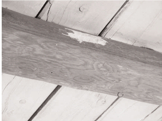
Fig. 7. Insect damage on a porch beam, as evidenced by the yellow frass from powder post beetles.