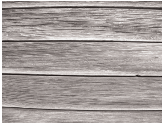
Fig. 5. Weathered cladding, considered aesthetically pleasing.

stiffness but also to determine whether there will be significant differential shrinkage if other woods are used for repairs.