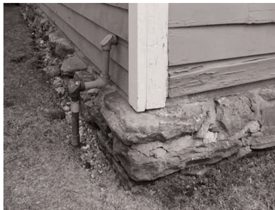
Fig. 11. Timber sill and wood cladding in contact with stone foundation.