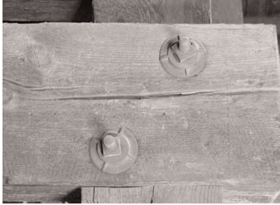
Fig. 4. Split between bolts caused by wood shrinkage.

Concerns about material properties. Material properties are important when wood components carry loads. To determine whether the existing wood can carry the required structural loads, it is important to know the appropriate strength and stiffness properties of the wood. Identification of the wood species is also an important factor, not only to calculate its strength and