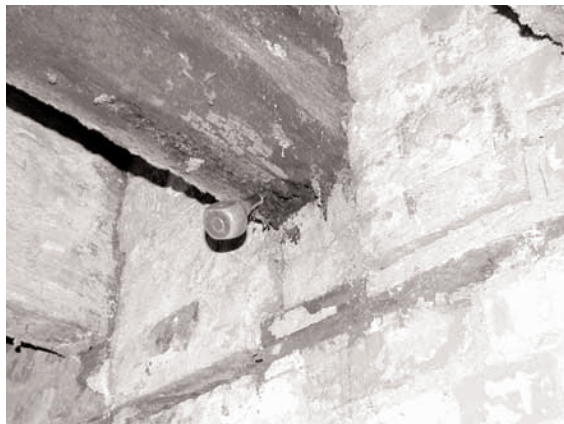
Fig. 8. Awl inserted to probe the interface between a timber beam and a masonry wall.

the knowledge of how grades are established within the design codes.