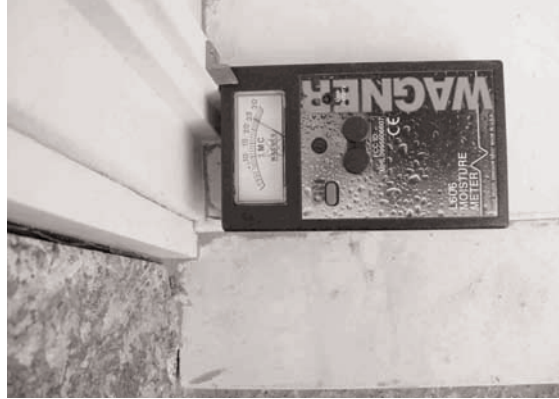
Fig. 9. Capacitance-type moisture meter being used on window sill.