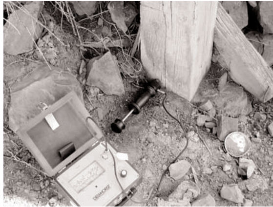
Fig. 10. Conductance-type moisture meter being used on a timber column in contact with the ground.